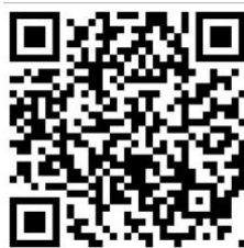
Dinosaur Parade Neelam Ahmad 2025