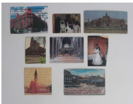
Weddings and Churches Horace Lindezey Hand embroidery and Applique 2025 NFS