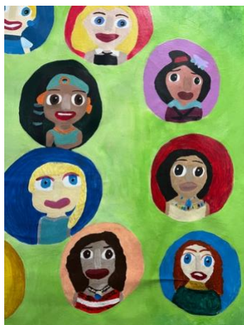
Disney Princesses Joe Mills Acrylic on canvas 2026 NFS