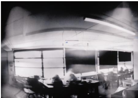
The Studio Grace White Analogue photography 2025