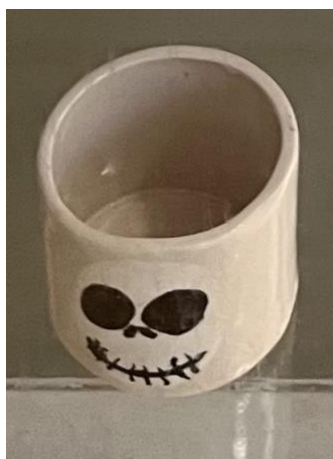
Plant Pot Becky Hislop ceramic