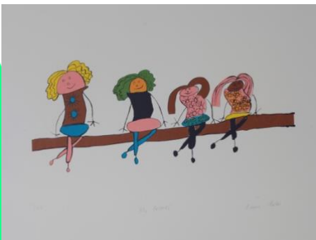
Emma Horton Limited Edition screen print 2026 £75 unframed £105 framed Edition of 25