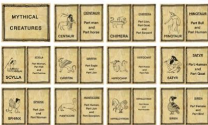
Mythical Creatures George Parker Conway Digital Illustration 2026 £65 framed print