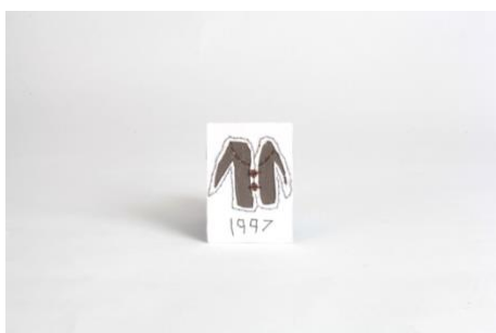
Suits Horace Lindezey Hand embroidery and Applique 2025 NFS