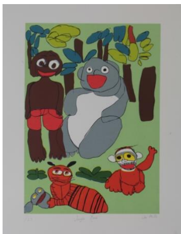
Jungle Book Joe Mills Limited Edition screen print 2026 £75 unframed £105 framed Edition of 25