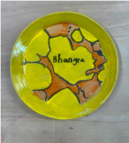
GLASS CABINET (freestanding)