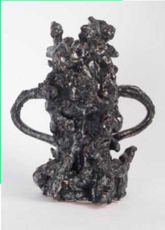
Untitled (trophy) Ben Goring 2024