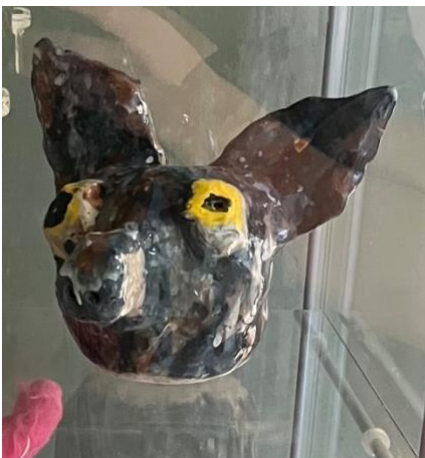
Untitled Joanne Robinson ceramic 2025 NFS