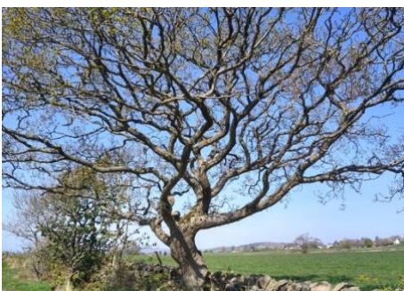
Tree David Parker Conway Digital photography 2025