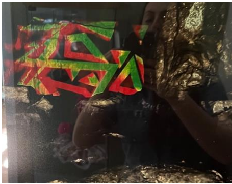
The Cave Malik Jama Still image of projection mapping 2025