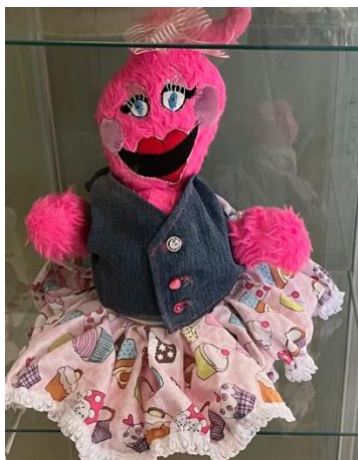
Lolly Louise Paterson textiles 2025