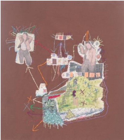
Untitled Poppy Maguire Hand embroidery and Applique 2025 NFS